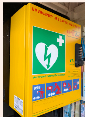
Only the Grafton cabinet is big enough to hold a bleed kit as well as a defibrillator

We have made it through the Expression of Interest phase and been invited to submit a full grant application.